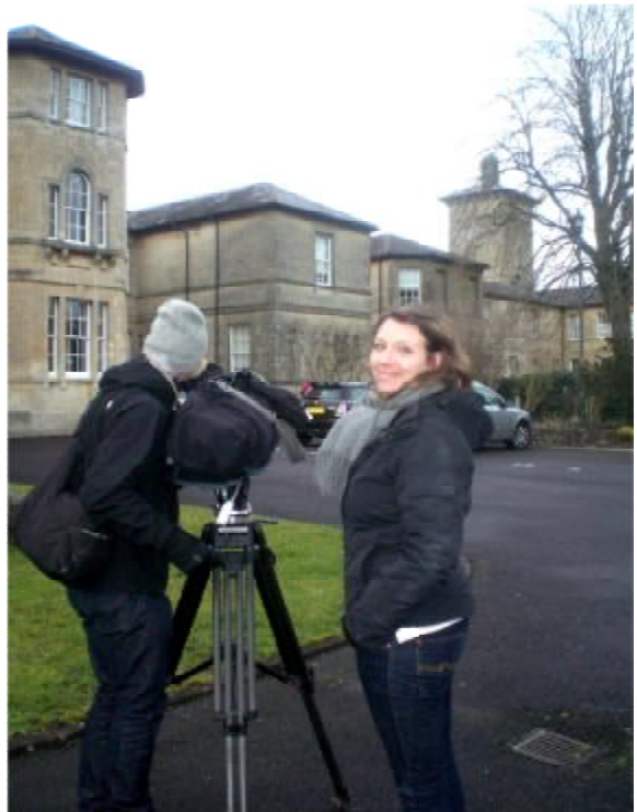
Exterior filming at Drews Park

Prior to the filming the producers contacted committee members, having seen information on both the Drews Park website and The Mews site and we were able to provide original floor plans, a timeline of the history of Roundway Hospital (as it was then) and put them in touch with people who worked here over time going back sixty years.